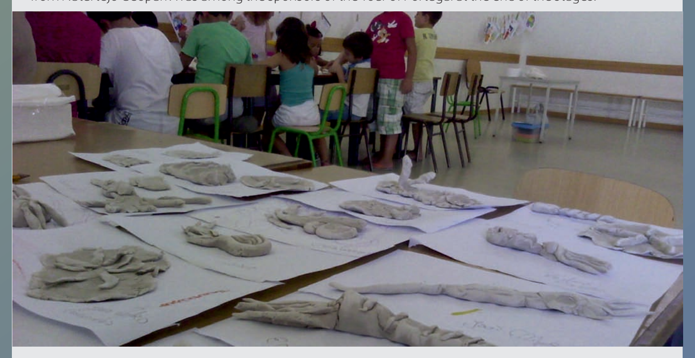
19 August – Workshop "Fossils for you" for the children of Idanha-a-Nova

14-15 August - 75th Tour of Portugal in Naturtejo Geopark. There is a long tradition of the Tour of Portugal in the area of the Naturtejo Geopark. This year there was the end of two stages in Castelo Branco and Termas de Monfortinho which brought much attention from national media to the region. A stand from Naturtejo Geopark was among the sponsors of the Tour of Portugal at the end of the stages.