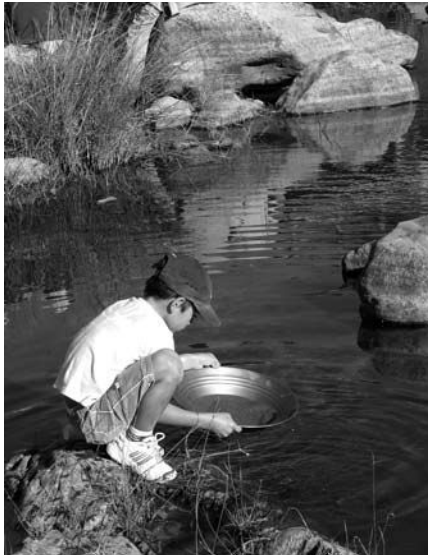
FIGURE 2: Portas de Almourão geomonument and setting, without the dam (left). Searching for gold as star-tourism product of this area (right).