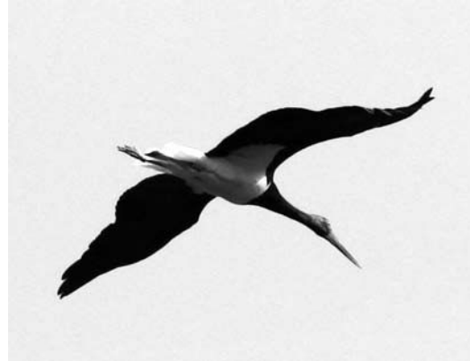
FIGURE 1: “Rock Detectives” visiting the newly declared Portas de Ródão Natural Monument (left). Black stork ( Ciconia nigra ) is increasing its number in Portas de Ródão, an Important Bird Area.