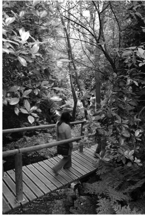
FIGURE 3: Fraga da Água d'Alta waterfall (left). Orvalho GeoTrail by the Água d'Alta deep valley surrounded by large numbers of the very rare Prunus lusitanica lusitanica.

Naturtejo Geopark is special for its geodiversity and people living there know their rocks better than any geologist...well, at least in their own ways! They are proud users of their geological legacy and they honestly ask for help concerning protecting and managing of geosites for local development. Since Naturtejo began the project to create a Geopark it plays fair firstly with the locals, but also with the institutional supporters, service enterprises and evaluators. Naturtejo Geopark is part of UNESCOassisted European and Global Networks without having used others for comparison, asked for favors or acted with influences to reach international recognition. Naturtejo is a European Geopark after much work still ongoing, interest of local people and politicians, and several right decisions. And do not ever forget: a Geopark is never the will of only a bunch of geologists, usually outsiders; locals shall desire to be deeply involved, and we are all working for a common goal which is local development: Geology is just another weapon...well, in our case and for now, the chosen weapon!