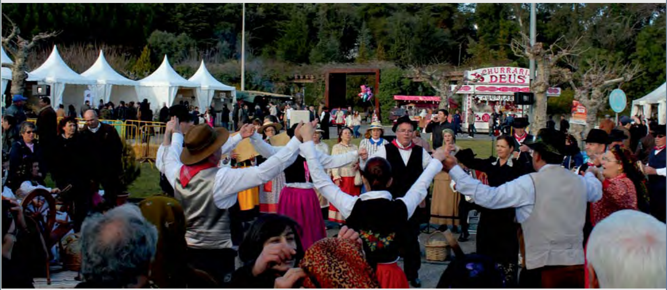
18 to 19 January – Fair of local gastronomy at Termas de Monfortinho.