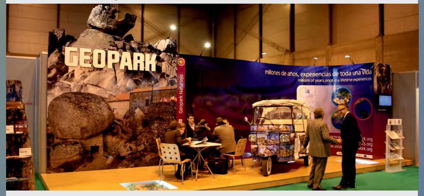
22 to 26 January – GEOPARK moving tourism in FITUR – International Tourism Trade Show of Madrid

21 to 23, 28 to 30 – First fieldtrips under "Rivers Project" for six classes from the municipality of Idanha-a-Nova. The field trip dedicated to the adopted sectors of Ponsul river meant for the general analysis of the selected area. Pupils collected data and took photos. Os alunos recolheram dados relativos ao troço que foram anotados numa Ficha de Campo e tiraram fotografias. During six days each class, respectively, studied their selected sector: 9°B – "Rosa Cometa"; 6°B – "Ichnological Park of Penha Garcia"; 9th grade Vocational (EPRIN) – Sr.ª da Graça; 8°A – Várzea; 9th Vocational – Idanha-a-Velha; 8°C – Idanha reservoir. A total of 115 pupils and 6 teachers were involved. The encharged staff were the teacher Arlindo Cardosa, Hugo Oliveira and Manuela Catana.